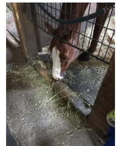
Judith Zozzaro with Taz